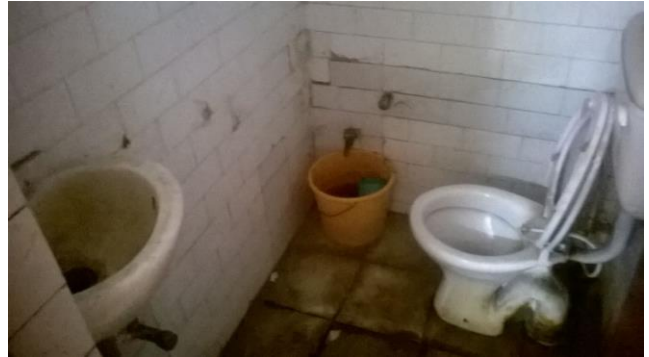
Toilet at Saharanpur courts with no water supply ever .