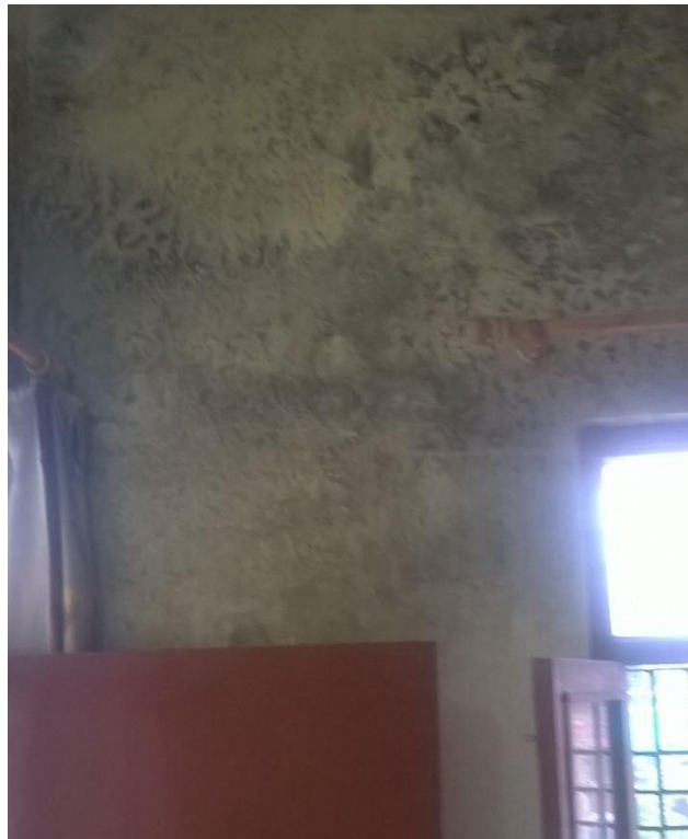
The wall of a dilapidated court room in UP