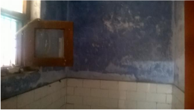
Stinking shared toilet in the courts of Saharanpur district, UP