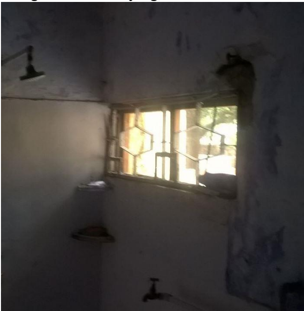
Wall crumbling down in the bathroom of a senior judge