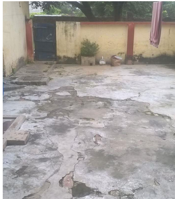
Ramshackle varandah in the residence of a senior subordinate judge

Request: Please send photographs of the working and living conditions of India's courts, judges and Police.